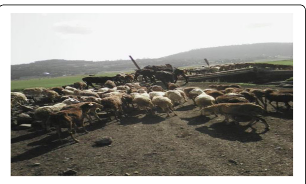
Fig. 2 Communal mixed livestock production system in the study area

Wollo highland sheep breed is one of the indigenous sheep breed found in the highland part of South Wollo administrative Zone at North East part of Ethiopia. They were characterized by short fat tail with short twisted/