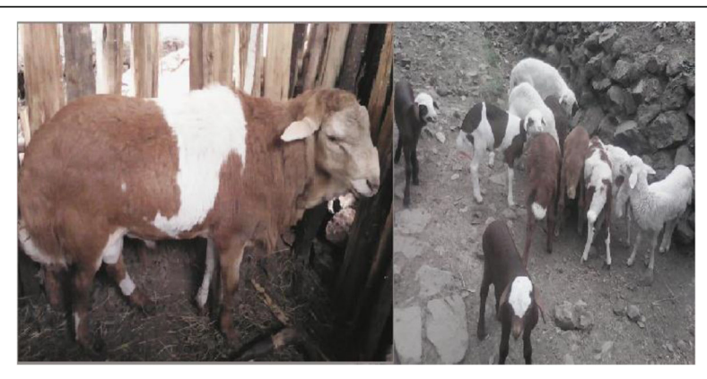
Fig. 4 Washera ram and its crossbreds on village community based breeding scheme

Thus, these proportions mean that; when 3 households drawn from local Wollo highland sheep breed owners, at the same time there should be 2 and 1 households draw from Washera rams F_1 crossbred progenies and Awassi rams F_1 crossbred progenies owners, respectively. In this way, the sample drawn as proportional to size stratified method from each stratum. According to this proportionality, the sampling ratio was calculated using addition of proportions (3+2+1), which gave as six, as value of total proportion. Finally, it divided to the smallest proportion, which equals to 1 by the total proportion of 6, and the sampling ratio were, 0.17 \approx 0.2 \ (or^1/6) for all strata.