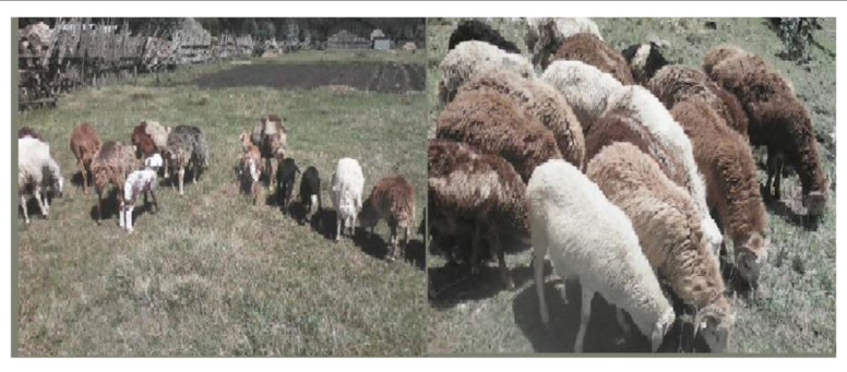
Fig. 3 Local Wollo highland sheep breed on private natural pasture grazing area